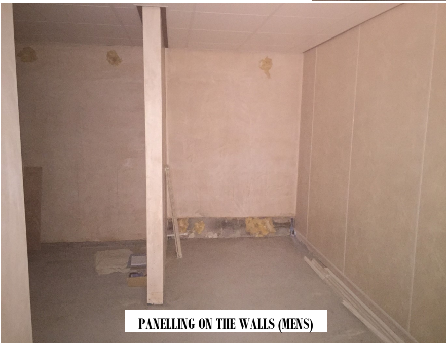
PANELLING ON THE WALLS (MENS)