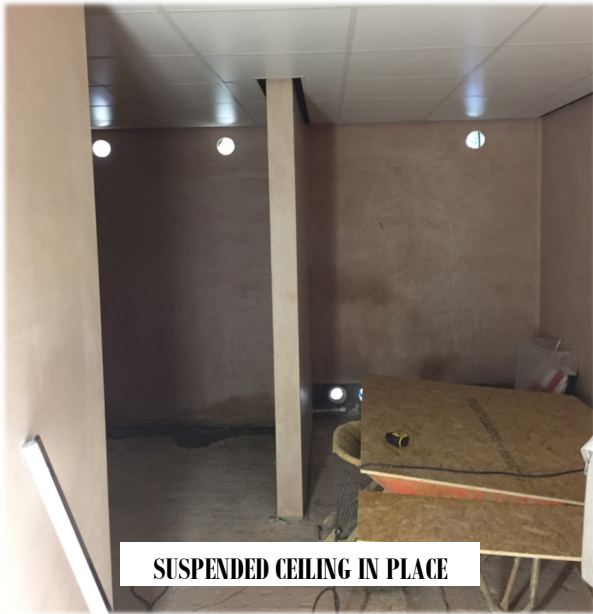
SUSPENDED CEILING IN PLACE