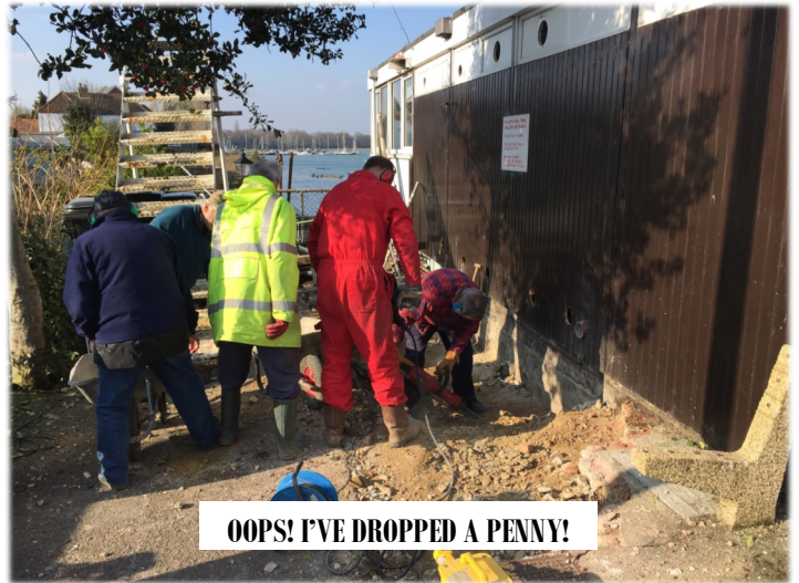
OOPS! I'VE DROPPED A PENNY!