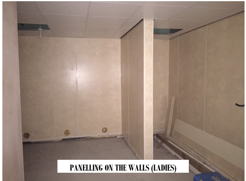
PANELLING ON THE WALLS (LADIES)