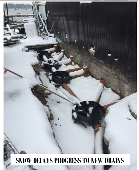
SNOW DELAYS PROGRESS TO NEW DRAINS