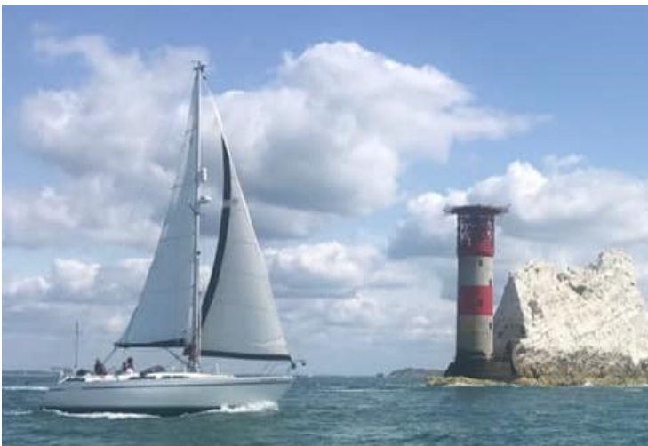
A few of the motley crews!

In the morning a few sore heads lined up on the start line off Lymington with a strong breeze for the Interclub Half Wight (race around the south side of the island back to Portsmouth). 5 boats from Hardway SC & 3 boats from Portchester SC making up the numbers to a fleet of 8 battled it out with a lively spinnaker leg as far as St Catherines but a decision to gybe sorted out the wheat from the chaff some opting to drop, whilst others braved it with varying success (broaching and broken spinnaker pole!) All surviving with no casualties must mean it was a success. Congratulations to the winners. (shown on Page 9)